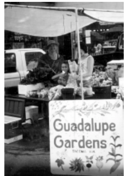
Guadalupe Gardens farmer and family at Tacoma Farmers Market.