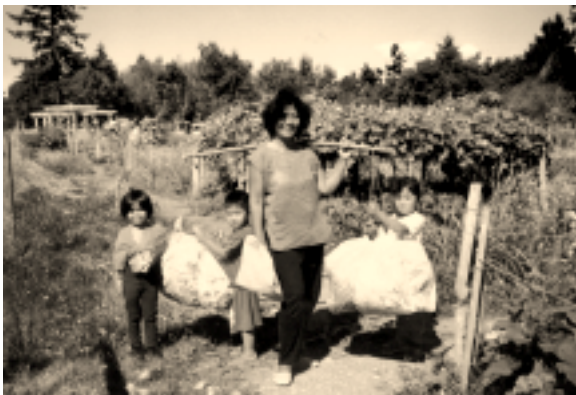
Cambodian gardening family at the Salishan Family Garden

One of the keys to building successful community food system projects is developing connections between diverse stakeholder groups. The nature of the relationships will vary, depending on the project's focus. All coalition members do not have to be equally involved in each project, but it is necessary that they are all kept informed. It takes a long time to build trust among diverse stakeholders. A year is a reasonable period to expect just get to know each other.